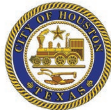
City of Houston